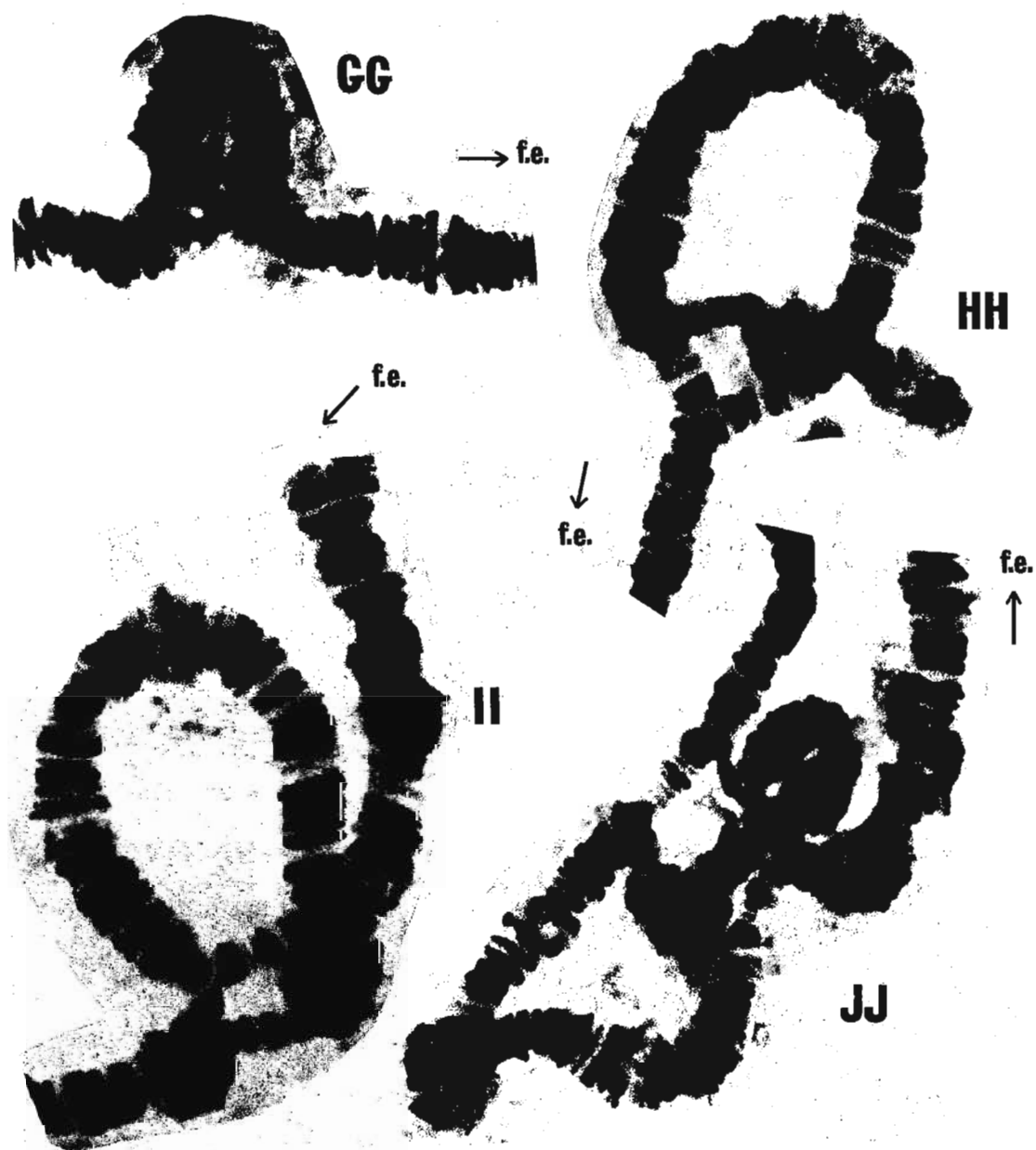
Nasuta complex inversions. f.e., free end.